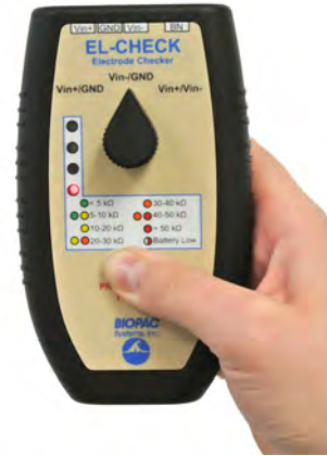
BIOPAC EL-CHECK video tutorial!

Use EL-CHECK to determine electrode/surface contact impedances. Measurements are selectable to a standard three-point contact (Vin+ to GND, Vin- to GND and Vin+ to Vin-). Electrode impedance range from < 5 kΩ to > 50 kΩ is indicated in seven levels. EL-CHECK accepts standard 1.5 mm Touchproof and BioNomadix connectors.